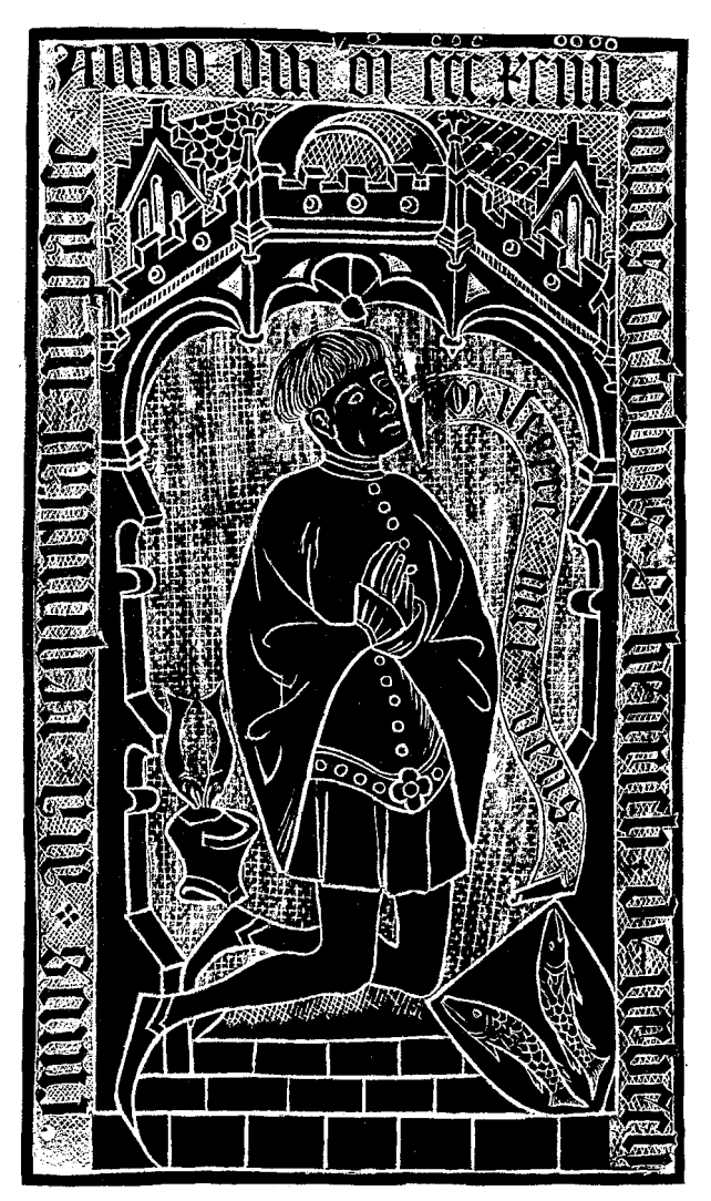
Heinrich von Urbech, 1394, formerly Meyenburg Museum, Nordhausen, now Angermuseum, Erfurt, Germany (H.K.C.1). (A Book of Facsimiles of Monumental Brasses on the Continent of Europe by W.F. Creeny (1884))

The surviving brass shows Heinrich in profile under a canopy with an ogee arch, cusped and crocketed, with a prominent finial, and Germanic-style window tracery above with a crenellated top, supported by side-shafts on top of columns with pronounced capitals. He gazes upwards to a Dextera Dei – the Hand of God – just beneath the canopy, protruding from what appears to be a halo representing the Trinity, in a blessing