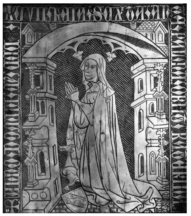
Katerina von Werther, 1397, formerly Meyenburg Museum, now Flohburg Museum, Nordhausen, Germany (H.K.C.4).