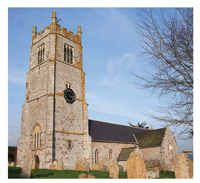
Colebrooke church, Devonshire.