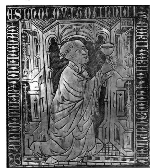
Jacob von Immenhausen, 1395, formerly Meyenburg Museum, now Flohburg Museum, Nordhausen, Germany (H.K.C.2).

Norris refers to all the brasses as the 'Nordhausen Series', consistent in style, suggesting a 14th-century school.<sup>3</sup> Kramer divides them into three types: