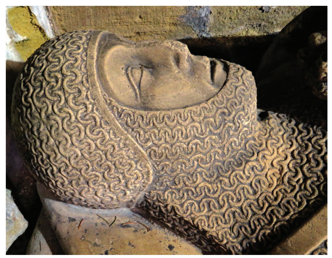
Knight with mail-clad skull-cap, c.1330-40, Felixkirk, Yorkshire (N.R.).

The book is accompanied by (downloadable) 200+ pages of Appendices, including a fully illustrated catalogue of the 231 figures involved, each newly reappraised. The book is lavishly illustrated, as befitting such a visual subject, with the total number of images (including the Appendices) in excess of 600, just over half of which are in colour. The paperback edition will be published in July and is currently available at a pre-publication discount of only £28. The offer is available at https://www.oxbowbooks.com/oxbow/ interpreting-medieval-effigies-67141.html.