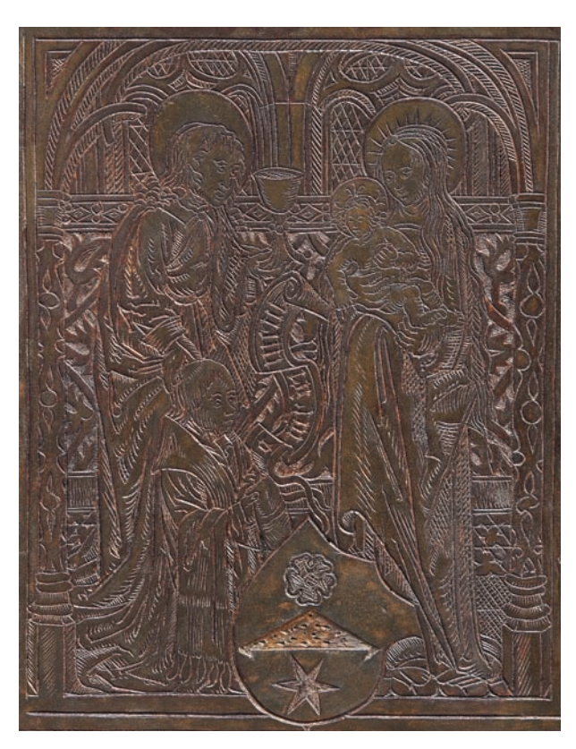
Lower dexter corner of the brass to Heinrich von Berchem, 1508, St. Maria-im-Capitol, Köln.

crossbar, in front of which stand the Mother of God with the child in her arms, and St. John the Baptist. The deceased, wearing a fur-studded almucia which shows that he is a priest, kneels below with a scroll in his hands reading: 'o [ma]ter dei mem[ento mei]'.<sup>26</sup> At his feet is a canted shield with his arms showing a triangular device between a rose and a six-pointed star. At the lower right corner is a chalice (170 x 95 mm). The whole composition is framed by a 50 mm-wide border decorated with lozenges.