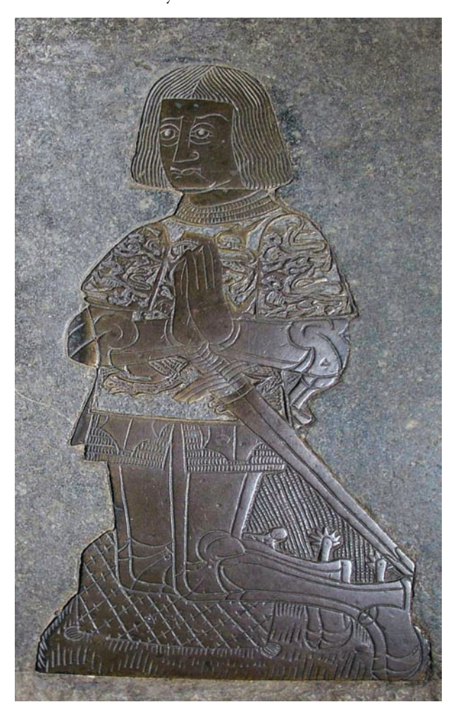
George Catesby, 1505, Ashby St. Ledgers, Northamptonshire (M.S.IV).

Norfolk, Stockton: William Wright, 1523 (LSW.11 and 12). In his will Wright requested 'a gravestone to cover my grave and a scripture of my name ther in price liijs iiijd'. The brass is now lost but was seen c.1605 when it was recorded as showing a gowned man and foot inscription. The indent survives. Effigy 655 \times 185 mm. Style: Norwich 6.26