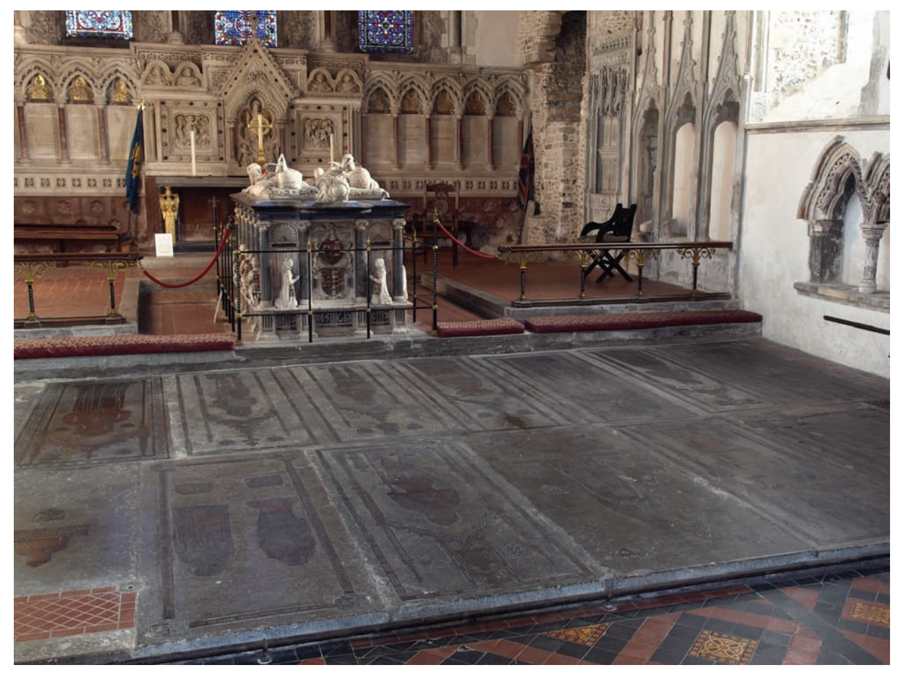
The magnificent array of Cobham family brasses in the chancel of Cobham church.

The day presented itself sunny, clear, and photogenically crisp as attendees trickled into the church dedicated to St. Mary Magdalene to admire the brasses, indents, tombs, and architecture. Churchwardens had thoughtfully placed identifying information beside each brass in the nave. How significant it feels to view the assemblage of brasses here, one of the largest and finest of any parish church, preserved in their original stones and locations rather than scattered about by later reordering or mounted on walls.